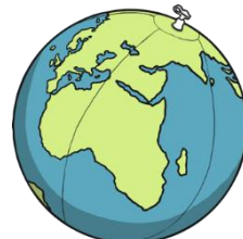
Seven Continents and Five Oceans