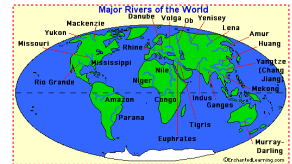
Rivers of the world